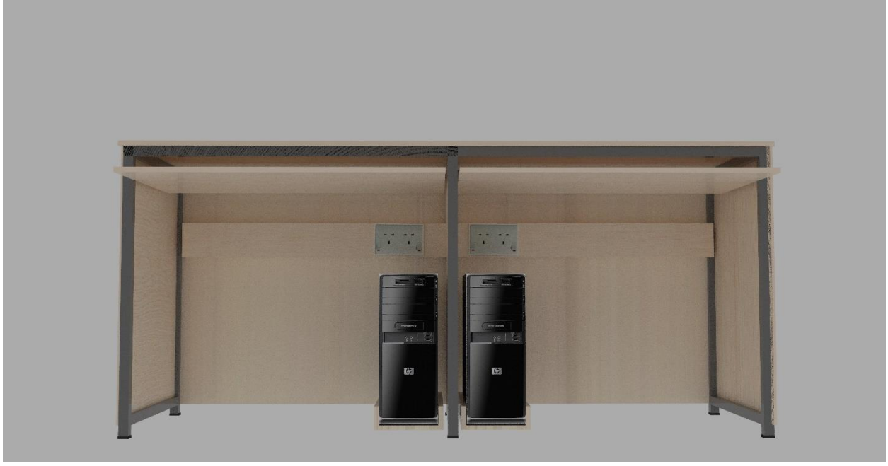
Two-Seater (CPU Box in Centre)