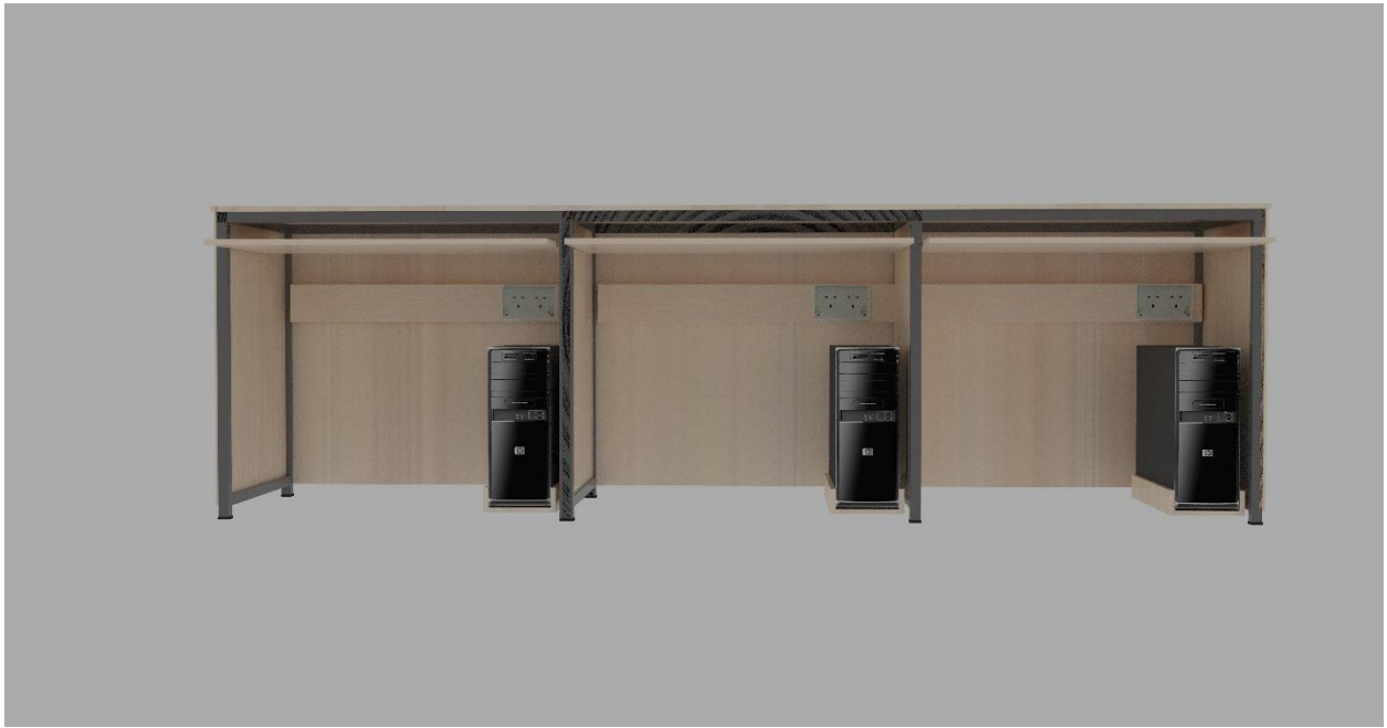
Three-Seater (With CPU Box on Right Side) 04 Tables